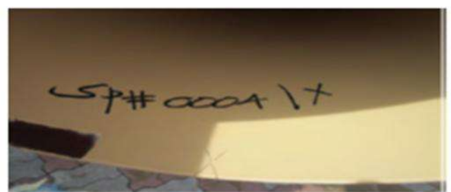
X-CUT ADHESION TEST