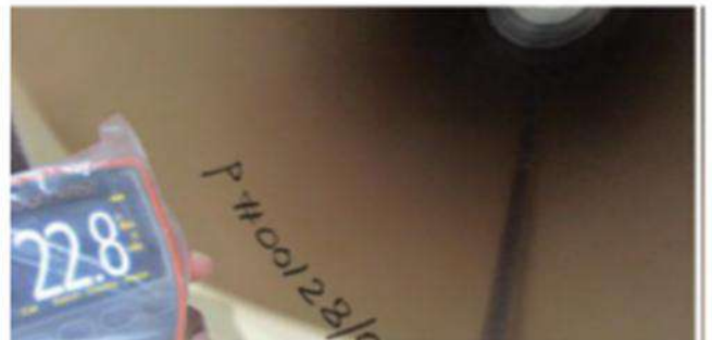
INTERNAL FBE COATING DFT (MILS)