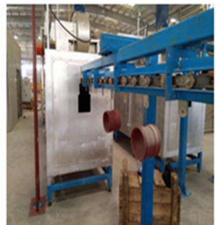
PRE-HEATING & POST CURING OVEN