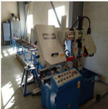
PIPE CUTTING MACHINE