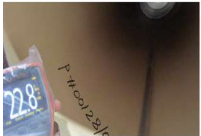
FBE Coating DFT