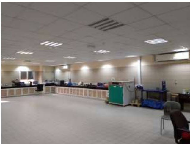
FBE Coating Laboratory